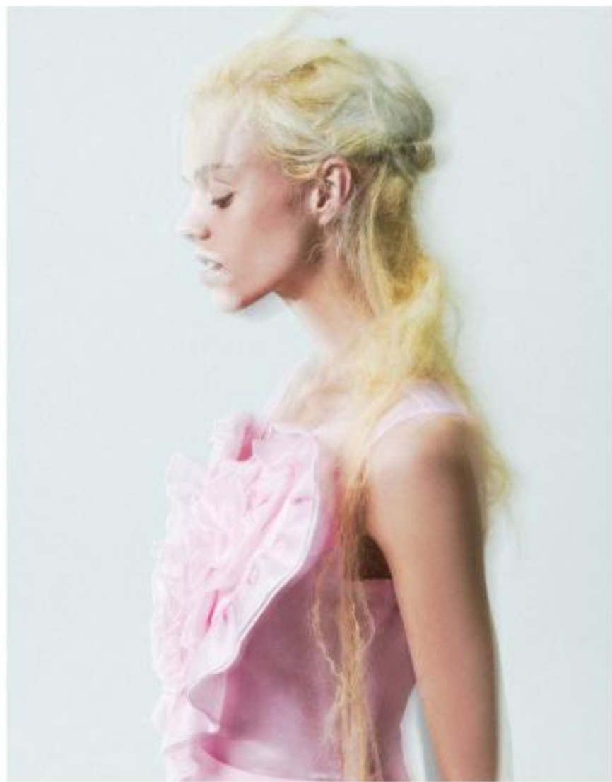
Violetta dress opposite page, Alberta Ferretti dress, Bonfilio Hats collar